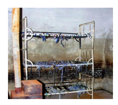
Prison cell with bunkbeds with no mattress, prisoners were obliged to sleep on. Stove for show only, never heated in cold winters.